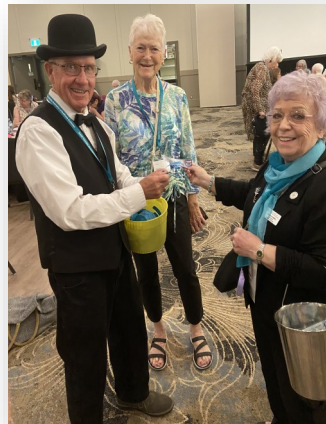
One of the 50/50 winners presenting her winning ticket!