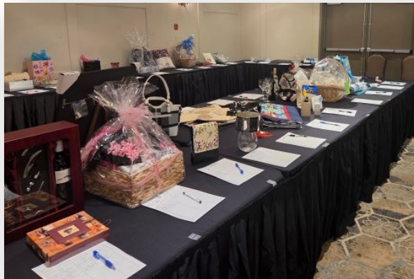
The Silent Auction