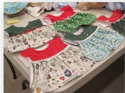
The Crafts Table showed off auxiliary crafting skills!!