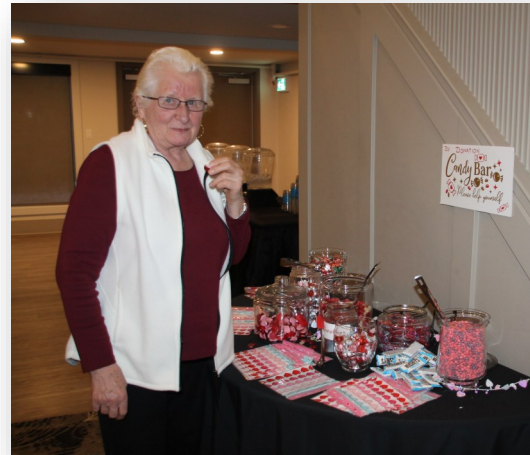
The Candy Bar!!