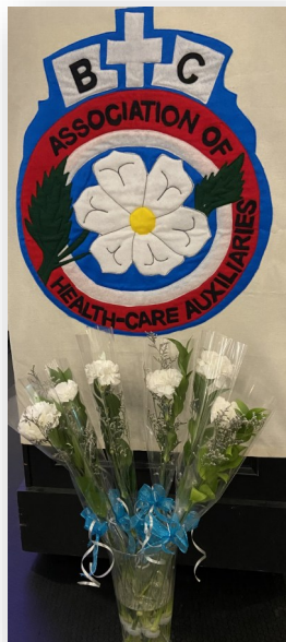
A moment of silence for members no longer with us.