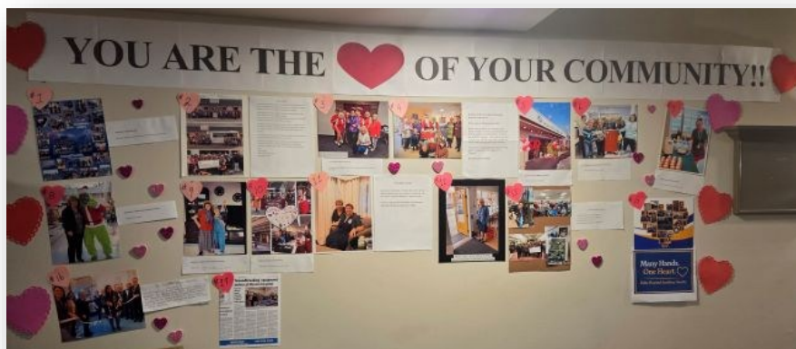
The Photo Contest