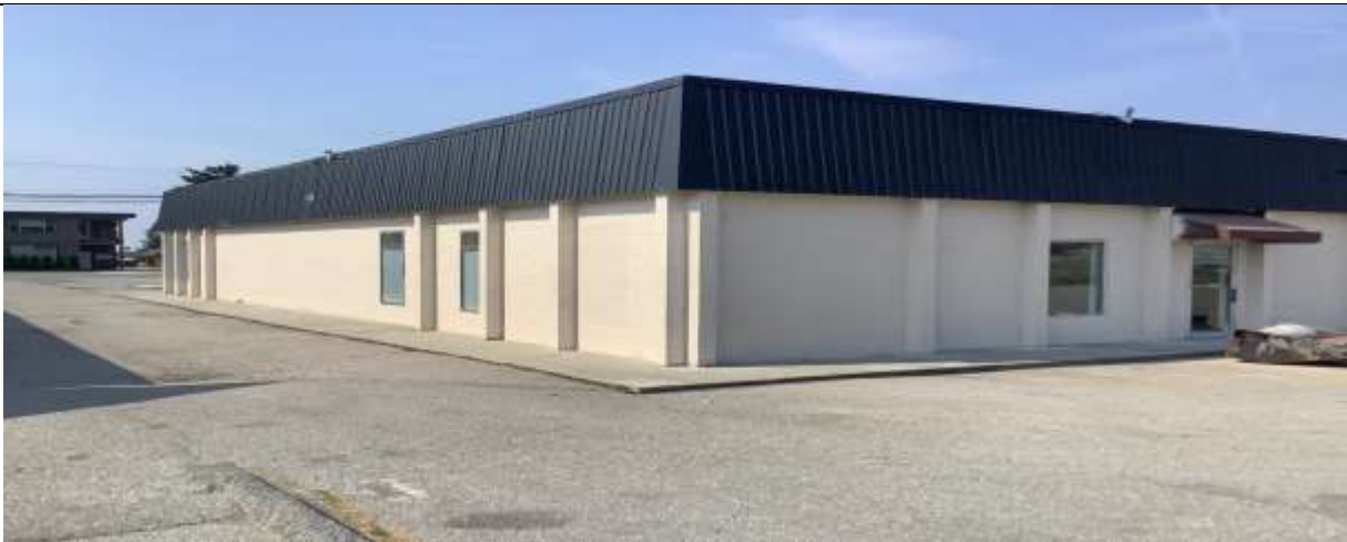
The fresh new look