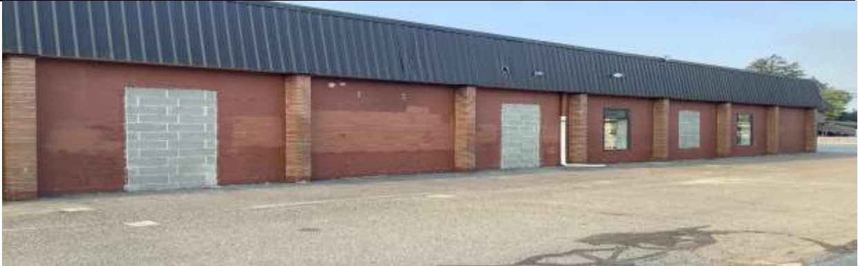
The before view