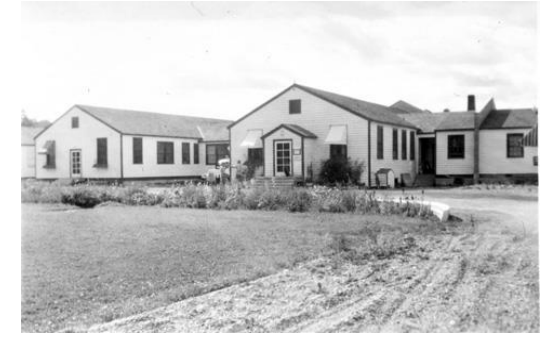
Prince George Army Barracks Hospital 1947

With the Expansion of the city after the Second World War the hospital was outgrown and with the availability of the now empty army barracks, plans were made to move. So in 1947 the hospital moved to Laurier and Lethbridge Street. Hospital insurance also arrived in the late 1940's and the Auxiliary's role changed. No longer were linens and produce needed; fund raising projects, such as teas, luncheons, dances, and many other creative ideas provided the ability to purchase equipment such as oxygen tents, bottle warmers, incubators and furnishings.