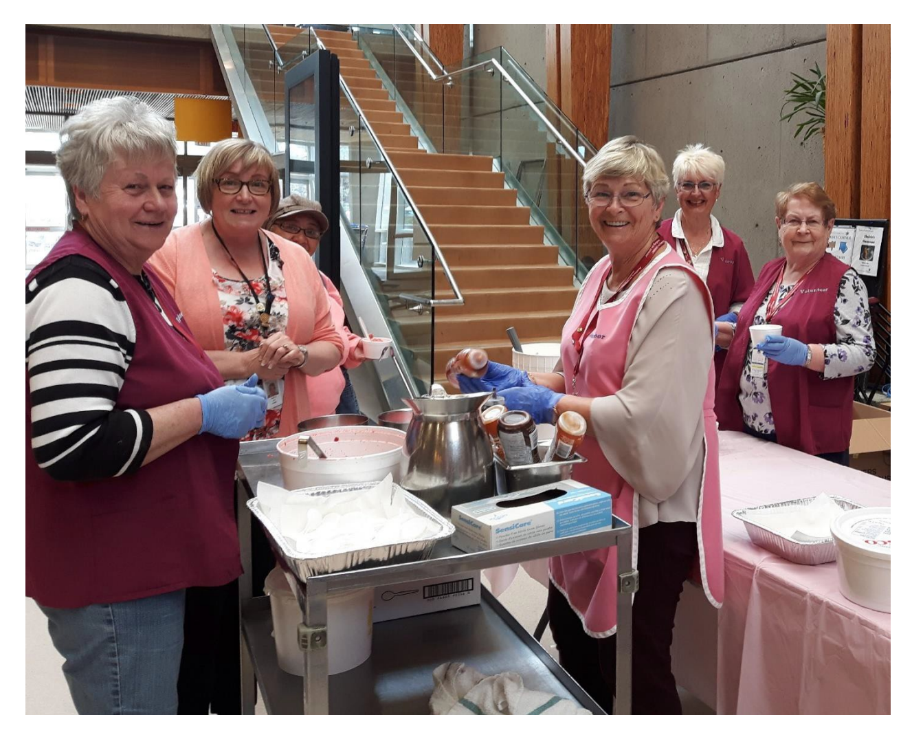
Auxiliary Day – May 2018